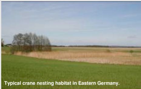
Typical crane nesting habitat in Eastern Germany.

This April, members of the project team travelled to the Scorfheide-Chorin Biosphere reserve in Eastern Germany to work with the local conservationists to collect eggs from wild cranes under licence from the German authorities. The nests were found in a variety of habitats – some came from alder swamps within dense forests, others from more open reed and sedge - dominated feld-sols or 'field hollows' surrounded by arable crops.