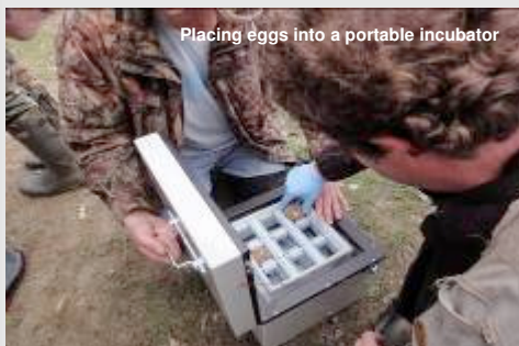
Placing eggs into a portable incubator

25 eggs were collected early on in the crane laying season, but after 15 days of incubation. This ensured that the eggs were robust enough to survive transportation, whilst giving the birds time to lay again within the same year.