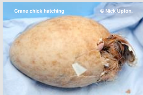
Crane chick hatching

After weighing and measuring in the field to ensure that the eggs were incubated for the right length of time, they were driven to a temporary incubation room in an old mill before being transported by road, rail and air back to WWT Slimbridge for hatching.