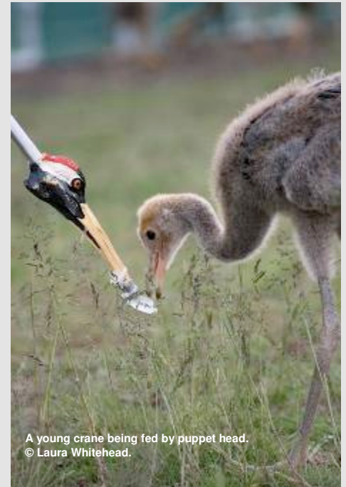
A young crane being fed by puppet head.

There are currently twenty two healthy cranes that are approaching fledging age and ready for the big move from the Crane School in Gloucestershire to the Crane Academy in Somerset. This move will take place sometime in August, with the first birds leaving the enclosure around mid September. The team of volunteers in Somerset will be busy making things ready for the birds over the coming weeks.